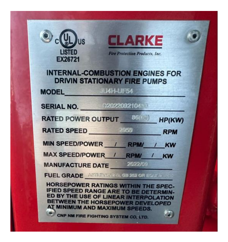
Figure 1. Photograph of the suspected counterfeit nameplate. A valid Clarke Fire Protection Products' nameplate would have the FM Approvals certification mark and a QR code present. It would not have a reference to CNP NM Fire Fighting System Co., Ltd at the bottom.