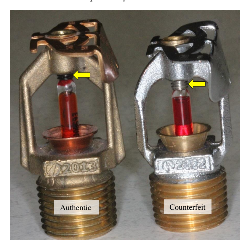
Figure 1. Photograph of an authentic Tyco TY3351 sprinkler (left) and a counterfeit TY3351 sprinkler (right).

Figure 1 is a photograph of an authentic TY3351 sprinkler next to one of the counterfeit sprinklers. Chrome-plated TY3351 sprinklers are also FM Approved even though this authentic example has no decorative finish. The markings on the wrench boss are similar between the two and include the name "TYCO" (on the opposite side to the one shown), the year of manufacture, and a mold cavity identification symbol. The shape of the frame arms of the counterfeit sprinkler are clearly different. The counterfeit also uses a visibly different compression screw, indicated by the arrows in the left photo, which is silver in color (even in chrome-plated authentic sprinklers, the compression screw is plain brass) and has several more exposed threads. The orifice caps are also visibly different. The authentic TY3351 uses a cold formed copper cap while the counterfeit has a machined cap with a yellow/brass color.