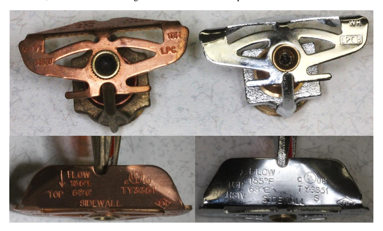
Figure 3 . Authentic TY3351 deflector (left) and counterfeit deflector (right). The markings are similar, including the appearance and position FM Approvals mark.

Figure 3 below shows the deflectors of the authentic and counterfeit sprinklers, left and right, respectively. The content and positioning of the stampings on the deflectors are largely the same, except for the "HSW" designation, which appears on the horizontal flange on the counterfeit, and the forward-facing surface of the authentic sprinkler.