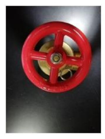
Figure 2 – Model A156 Valves: The suspect counterfeit valve has the wrong model number cast on to the valve body and it is missing the Giacomini logo.