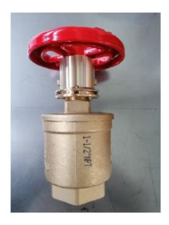
Figure 8: Counterfeit A155 1-1/2" Pressure Restricting Valve (Side View) - The thread type is printed on the body of the actual valve.