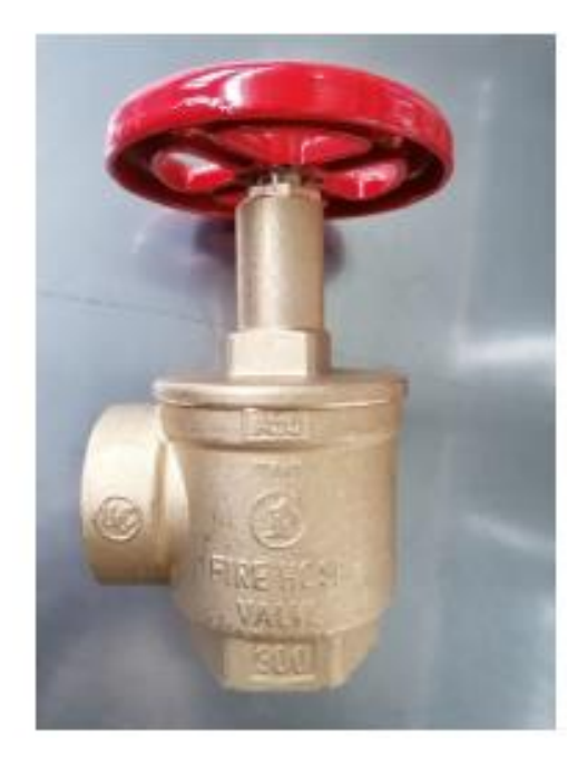
Figure 4: Counterfeit A55 1-1/2" Standard Hose Valve - the counterfeit products are illustrated by the images on the left while the examples on the right are the actual FM Approved products.