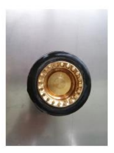
Figure 3: Counterfeit A7 1-1/2" Firehose Nozzle (Top View) – The machining of the teeth on the counterfeit nozzles are irregular (randomly squared, trangular, etc).