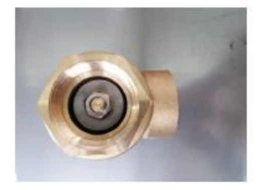
Figure 6: Counterfeit A55 1-1/2" Standard Hose Valve (Bottom View) – The nut on the counterfeit valve is made of carbon in comparison to stainless steel which is in accordance with requirements on the actual valve.