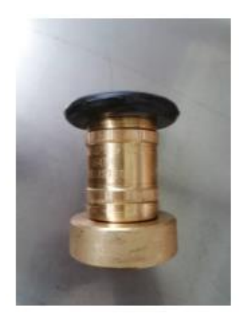
Figure 1: Counterfeit A7 1-1/2" Firehose Nozzle - the counterfeit products are illustrated by the images on the left while the examples on the right are the actual FM Approved products.