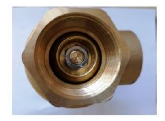
Figure 9: Counterfeit A155 1-1/2" Pressure Restricting Valve (Bottom View) - The nut on the counterfeit valve is made of brass in comparison to stainless steel nut on the actual valve.