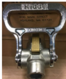
Figure 1: Horn-Valve with Horn removed